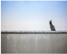
The cat is on the roof.