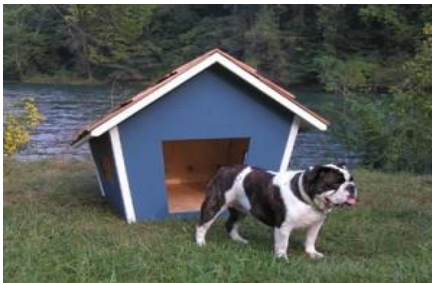
The dog is outside the dog house